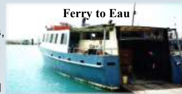
Ferry to Eau

A few of us decided to go to the pictures as "The Passion" was showing. The notice board said Friday night, so we went along and then discovered it was changed to Saturday at 8.00pm. We tried again and as I got there first, a lady said that the film had already started. I waited for my friends and in we went. The theatre was pitch black and we had to feel along the aisles as some had the seats missing, we didn't want to end up on the floor! We eventually found seats, the screen was very small and splattered with paint. The subtitles were in English but because of the small screen the beginning and end of the sentences were cut off.