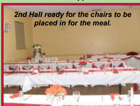
2nd Hall ready for the chairs to be placed in for the meal.