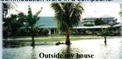
Outside my house

The class rooms and our accommodation were in a compound. A lawn separated the houses from the school. When it rained the lawn was knee high with water so we had to put down bricks to get out of our houses. When the rain was really heavy, school was cancelled as it was impossible to hear anything with the rain on the tin roofs.