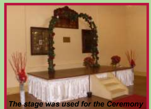
The stage was used for the Ceremony