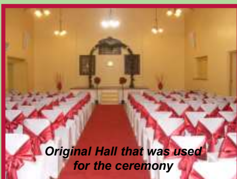
Original Hall that was used for the ceremony

If you are hiring the hall you can hire the red carpet runner and the skirt for the stage. Call Pat on 8280 0000 to make an appointment to view the Institute.