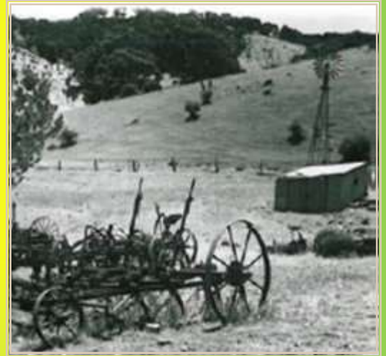
Pictured above are photos of how the Slater's farm looked back in the 1960s.