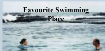
Favourite Swimming Place

There are a lot of blowholes, so when the tide is coming in it's a bit risky walking across them as a spout of water can shoot up your backside! To swim we were required to wear a top of some kind which would cover our arms and a long dress or long shorts below the knee.