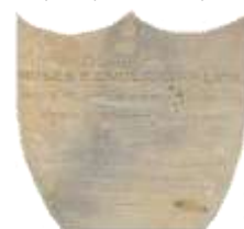
Pictured is the grave of Moses Bendle Garlick along with the enlarged plaque that is on the monument at the One Tree Hill Cemetery.