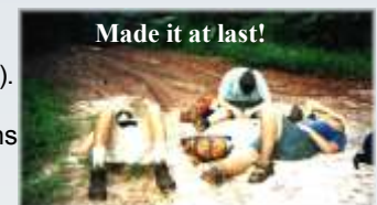
Made it at last!

Tonga is made up of many islands, during the holiday time a few of us went to some of the larger islands. The island of "Eua" was our first visit, we went across by ferry and I saw one life jacket on board. (Luckily we didn't need it!) Eua has high mountains and is covered with tropical vegetation. One Sunday, four of us decided to set off exploring the place, all of the guide books said to take a guide, but being so "Smart" we decided we didn't need one. After a half a day of walking we were lost! Being a Sunday nobody was around. We tried to retrace our steps but took a few wrong turns. Eventually we made it back although at one stage we thought that we would be there for the night. (At least we had water). We were very tired after walking nonstop all day and due to the thorns our legs were very scratched. (I ended up with an infection from the scratches). As well as the infection my big toe nails were cramped in my sneakers after the long walk and ended up going black, both of the nails eventually dropped off.