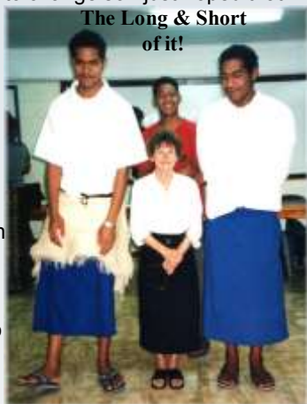
The Long & Short of it!

The weather in Tonga was hot and humid, (over the year, due to the heat I lost 6.5kilos and when I returned home I was told that I looked as if I had been in a concentration camp!) My skirts were falling off so I went to a dressmaker. The shop was right on the pavement and there was nowhere to change so I just hoped that no one passed by when changing clothes. The dress maker had no tape measure, she just used her fingers to gauge an amount to take in and fortunately her finger measurements were correct.