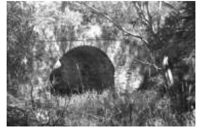
Snake Gully Bridge today.