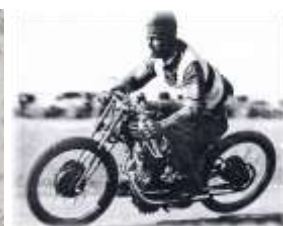
A speedway bike from 1912, Photo for illustration purposes only.