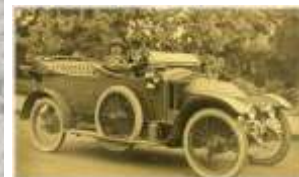
The car that they would have been travelling in would have been similar to this.